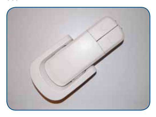
Fig. 2.2: call and send station

The call and send stations will not function when the cover is placed over the seat.