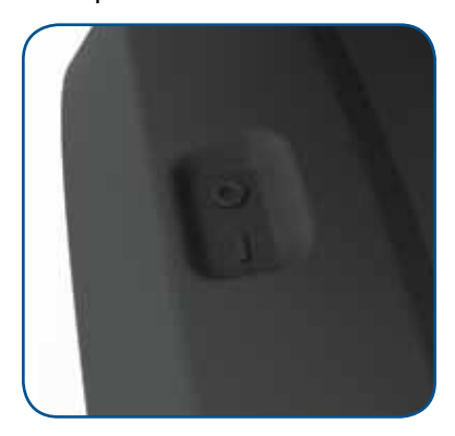
Fig. 2.3: main switch

It is recommended that you switch the chairlift off if you will not be using it for a period of more than two weeks.