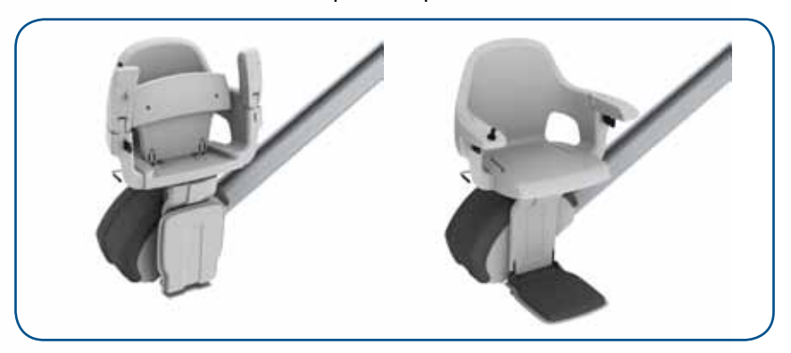
Fig. 2.4: Folded and unfolded chair

The chairlift can be folded up when parked.