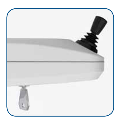
Fig. 2.1: control unit with keyswitch