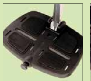
120-639 Footplate 120-816 Footplate raiser 120-675 Long sitting extension (not shown)