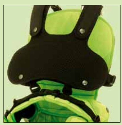
8. Trunk harness