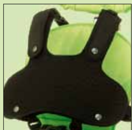
120-799 Small trunk harness 120-757 Medium trunk harness