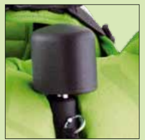
120-641 Pommel 120-856* Leg pad guide assembly (not shown)