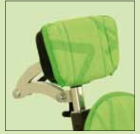
117-850* Flat headrest cushion Does not include hardware