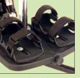
117-1781 Small sandals 117-2781 Medium sandals