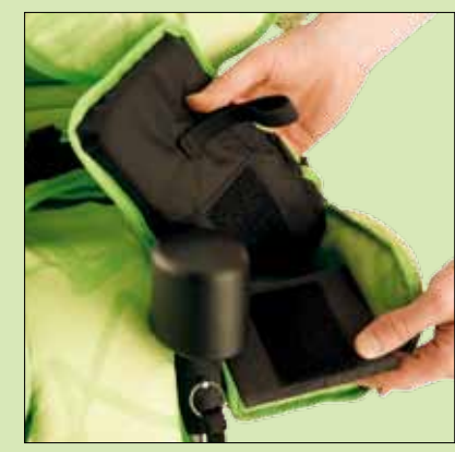
2. Ramped base cushion