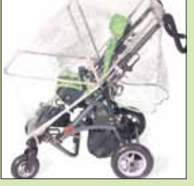
RC01 Raincover (for use with stroller only)