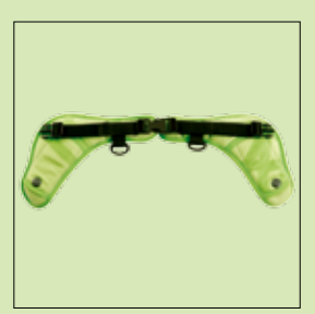
120-844* Pelvic harness small 117-848* Pelvic harness medium 120-789 Pelvic harness spacer pads