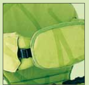
137-808* Support harness