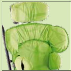
120-702 Shoulder support assembly 120-828* Shoulder support cushion