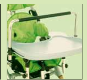
117-769 Grab rails 120-657 Grab rail for buggies