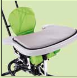
120-270 Padded tray insert