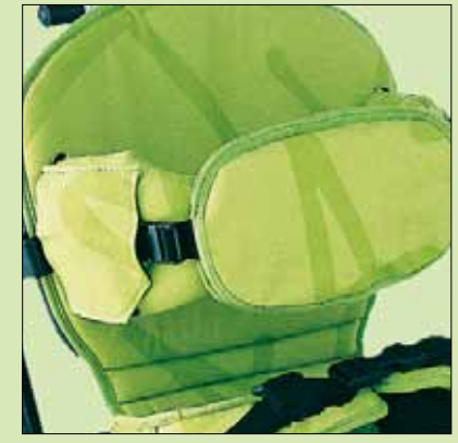
7. Optional chest harness