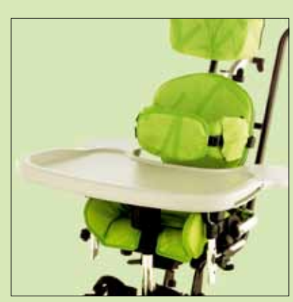
14. Activity tray