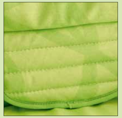
1. Flexible lumbar and sacral cushion