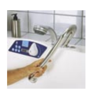
The support handle gives the resident increased support and security.