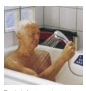
The built-in shower handle is comfortable and always within easy reach.