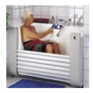
The unique Roll-Door of the Freedom Bath makes the entry and exit easy and safer than in standard bath tubs.

The built-in mixer for filling and showering makes the bath very easy to install – you simply connect the unit to the power, the mains water supply and drainage.