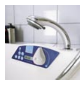
The built-in mixer for filling and showering makes the bath easy to use, and also simplifies the installation procedure.