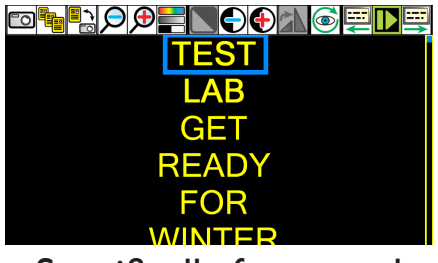
Specifically for tunnel vision (RP)