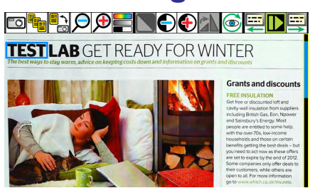
For photographs and hand written text