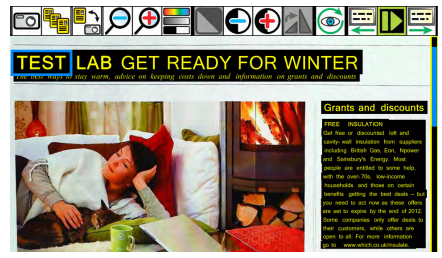
Ideal for diagrams & bank statements