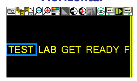
Text on a single line