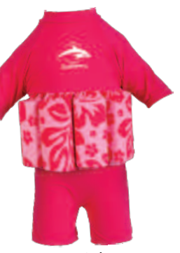
Pink Hibiscus tshirt