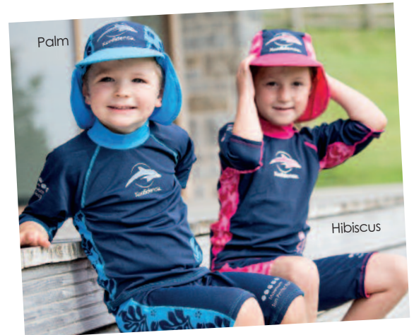
UV Legionnaires Hats