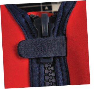
Chunky YKK Zip with velcro guard to keep in place