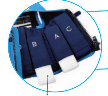
Easy to use removable 8 float system for adjustable buoyancy