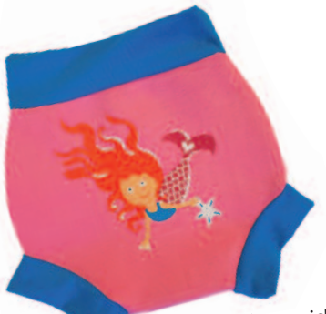
BABY SWIM SCHOOL APPROVED DESIGN